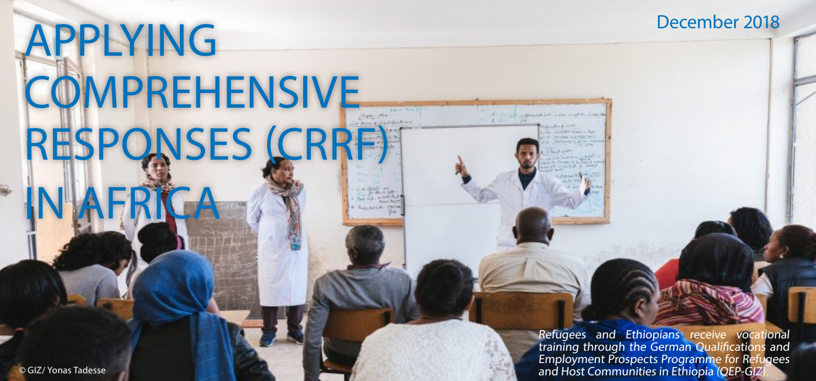
Refugees and Ethiopians receive vocational training through the German Qualifications and Employment Prospects Programme for Refugees and Host Communities in Ethiopia (QEP-GIZ).